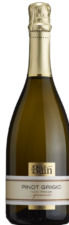
PINOT GRIGIO DOC BRUT