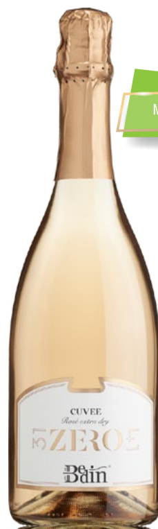
CUVÉE ROSÉ EXTRA DRY