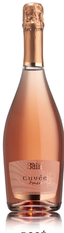
ROSÉ EXTRA DRY

Pale straw-yellow in the glass with a delicate perlage, this sparkler shows an uplifting grapey bouquet with elements of apple and pear. The palate is fresh and lively, with vibrant acidity meeting flavours of fresh pear. The finish is crisp and cleansing with a lovely line of minerality.