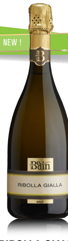
RIBOLLA GIALLA BRUT