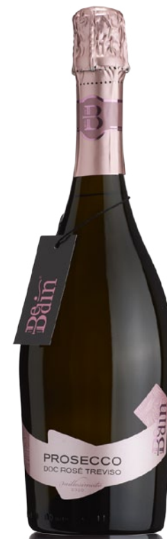
ROSÉ BRUT MILLESIMATO