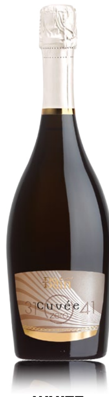
WHITE EXTRA DRY